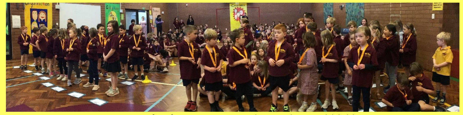
A group picture of our first timers in 2023 – welcome to the PBAC club kids!

The PBAC has required individuals to record one hour of physical activity, five days a week, for ten weeks.